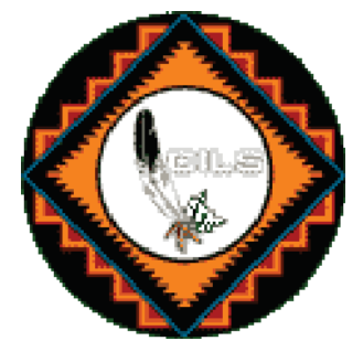
Thank you to California Indian Legal Services for your support